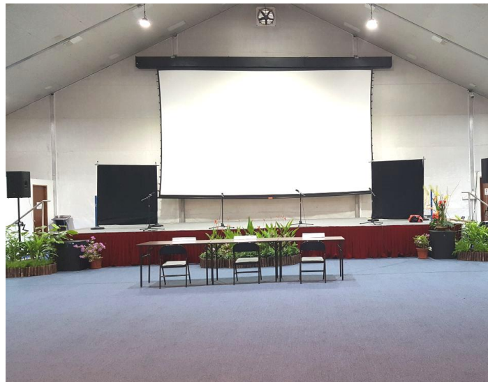
Photo of Marquee stage

A projector screen will be placed at the back of the stage in the middle (above set up may differ)