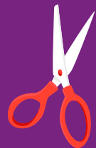
A pair of Scissors