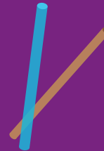
Straw or Wooden Stick