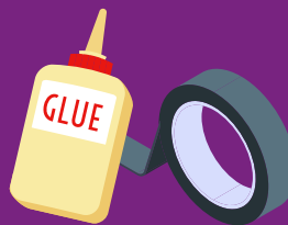
Glue or Tape