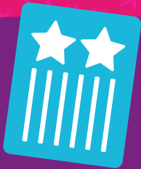
Magic Wand Template (See page 3)