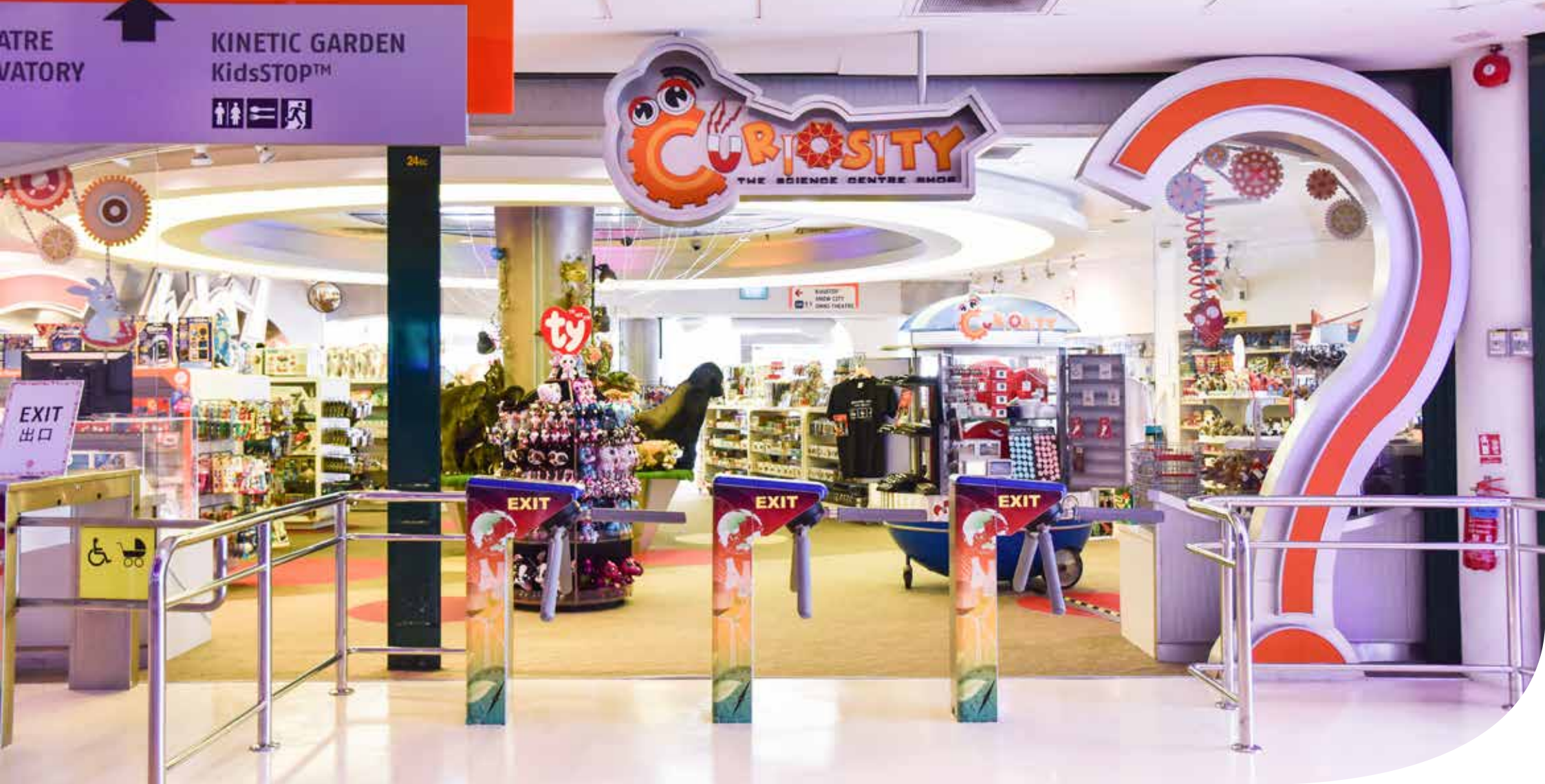
This is the EXIT . The EXIT is near the CURIOSITY shop.