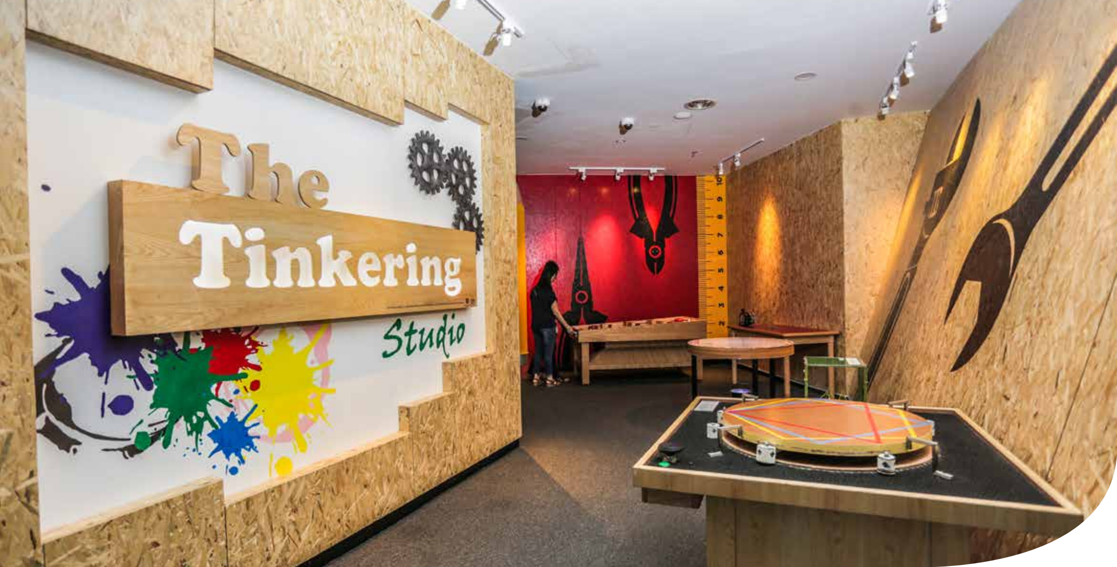
This is The Tinkering Studio .