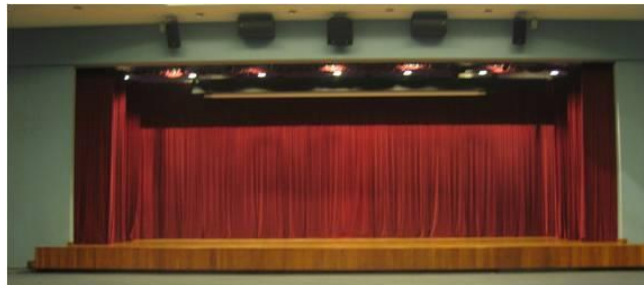
Front view of stage