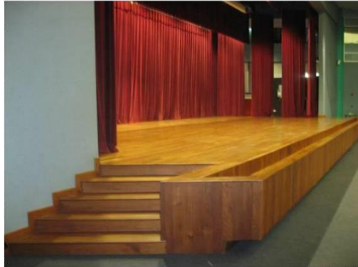
Side view of stage