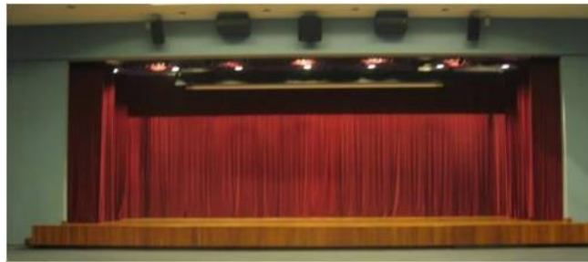
Front view of stage