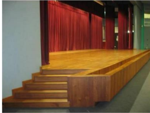
Side view of stage