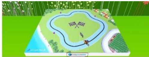
Figure 6: Line tracking example

In this task, teams are required to program an autonomous car to track lines using infrared (IR) sensors mounted on the car in a smart town.