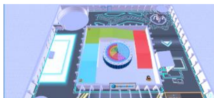
Figure 8: Smart sensing example

In this task, teams are required to program an autonomous car to detect road markers and navigate in a smart town using RGB colour sensor and IR sensors mounted on the car.