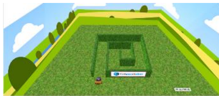
Figure 7: Obstacle avoidance example

In this task, teams are required to program an autonomous car to avoid obstacles using ultrasonic sensor mounted on the car in a smart town / maze.