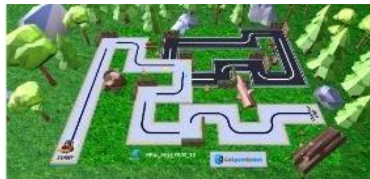
Figure 10: Open challenge example

In this task, teams are required to program an autonomous car to complete open challenges using all sensors mounted on the car.