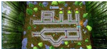
Figure 9: Path planning example

In this task, teams are required to program an autonomous car to plan the best path using gyro sensor when traveling in the smart town.