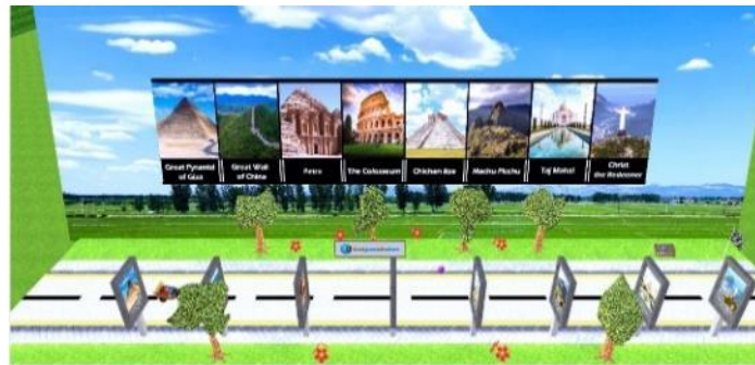
Figure 4: VIRTUAL_WORLD Layout