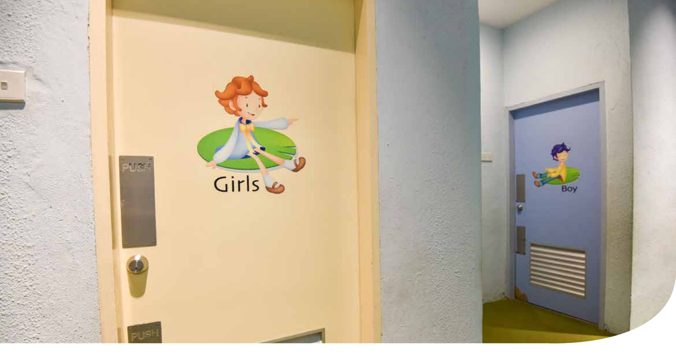
I will tell my family if I need to go to the toilet. I will have to line up if there are other people in the toilet.