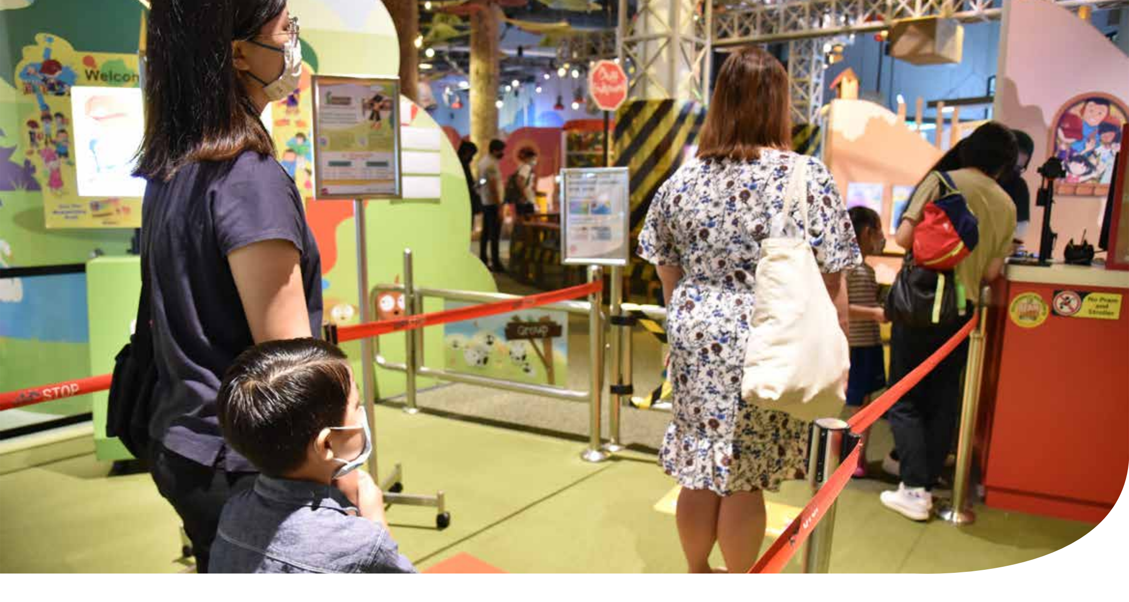
I may need to queue up with my family to enter KidsSTOP™.