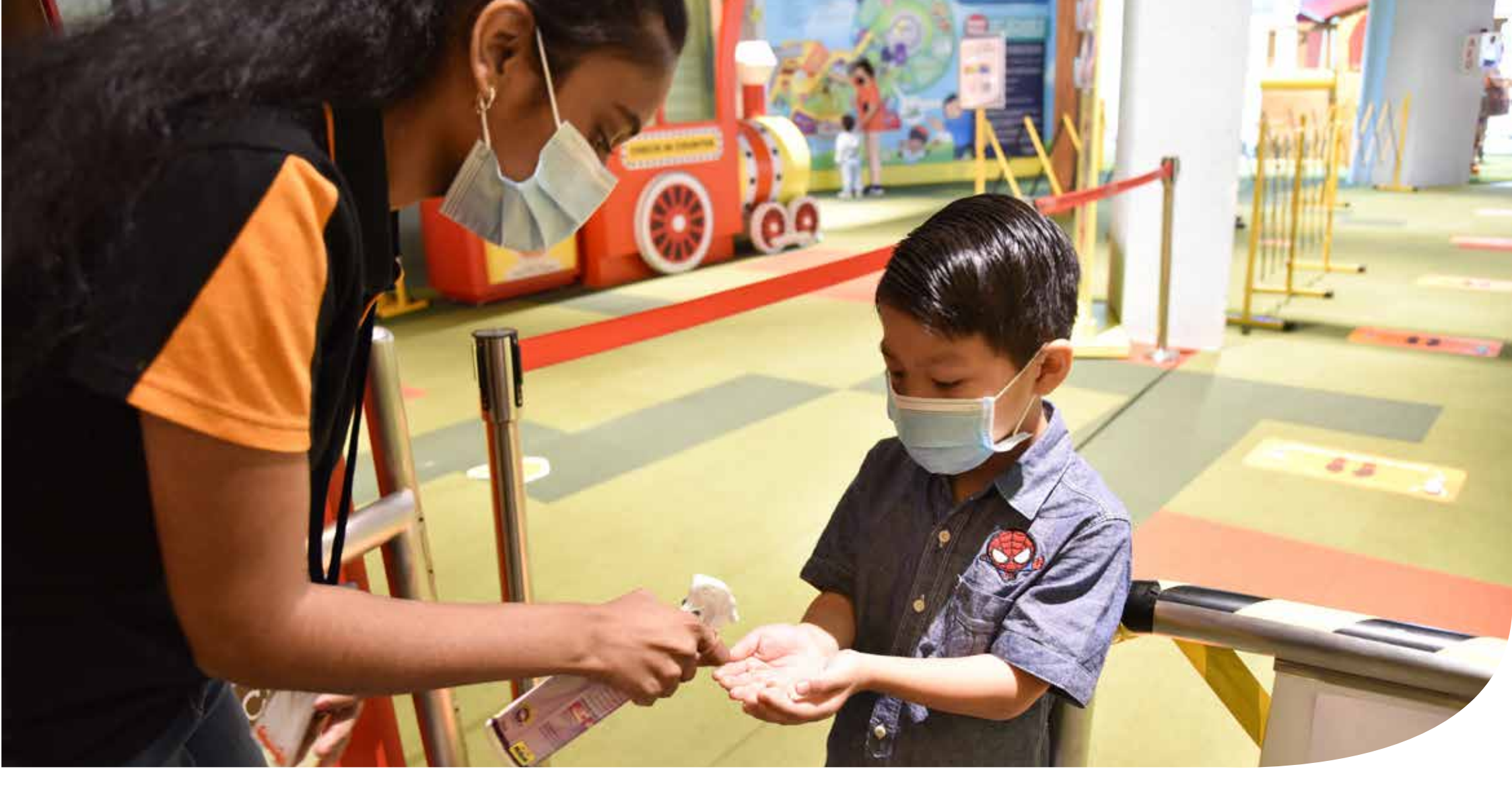
Next, they will sanitise my hands.