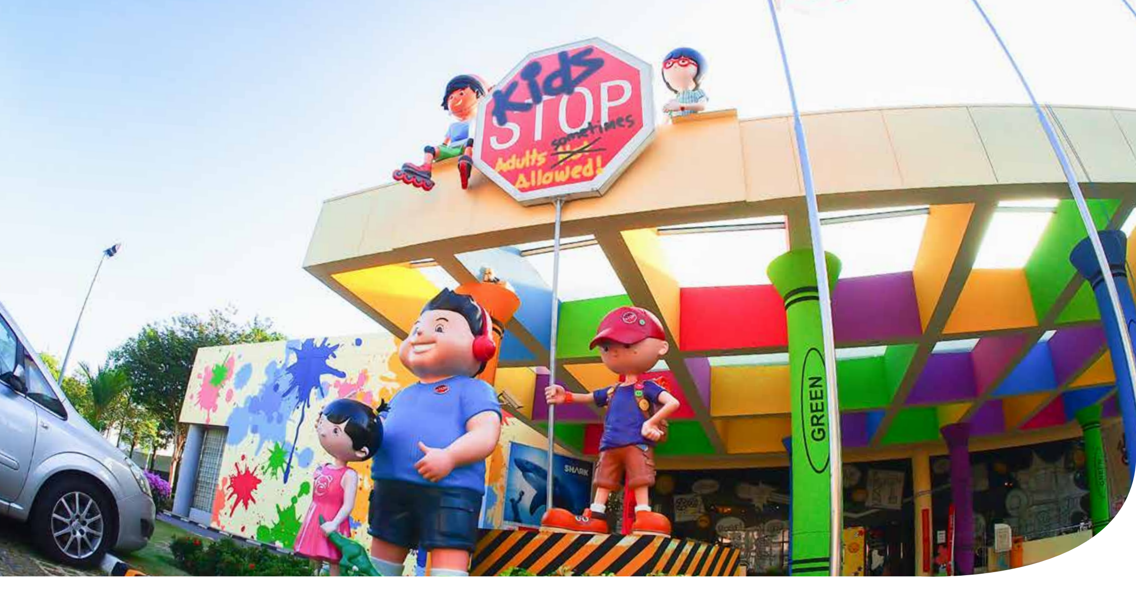
I am going to visit KidsSTOP™ today.