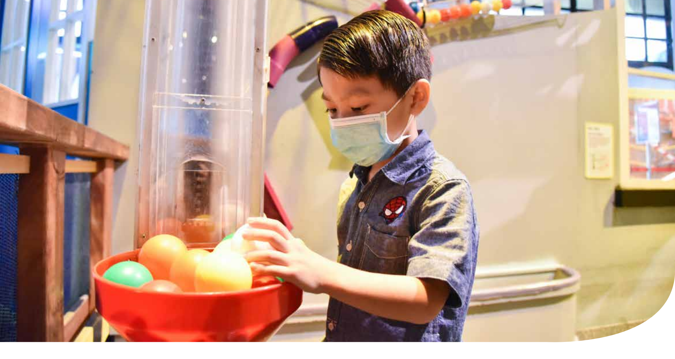
I can use crane and crank to transport balls. I can also move the gears.