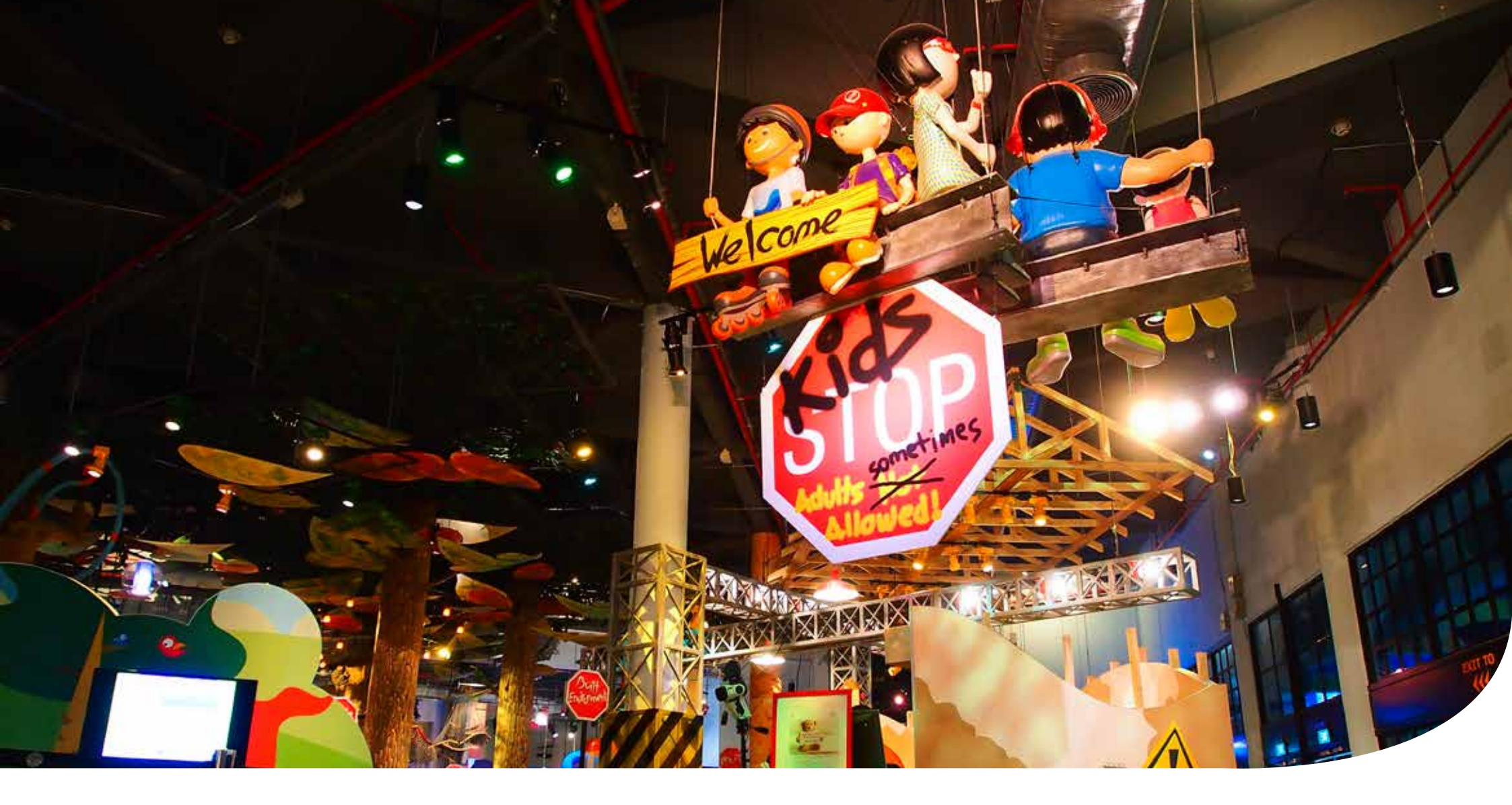
I can learn all about Science and have lots of fun at KidsSTOP™.