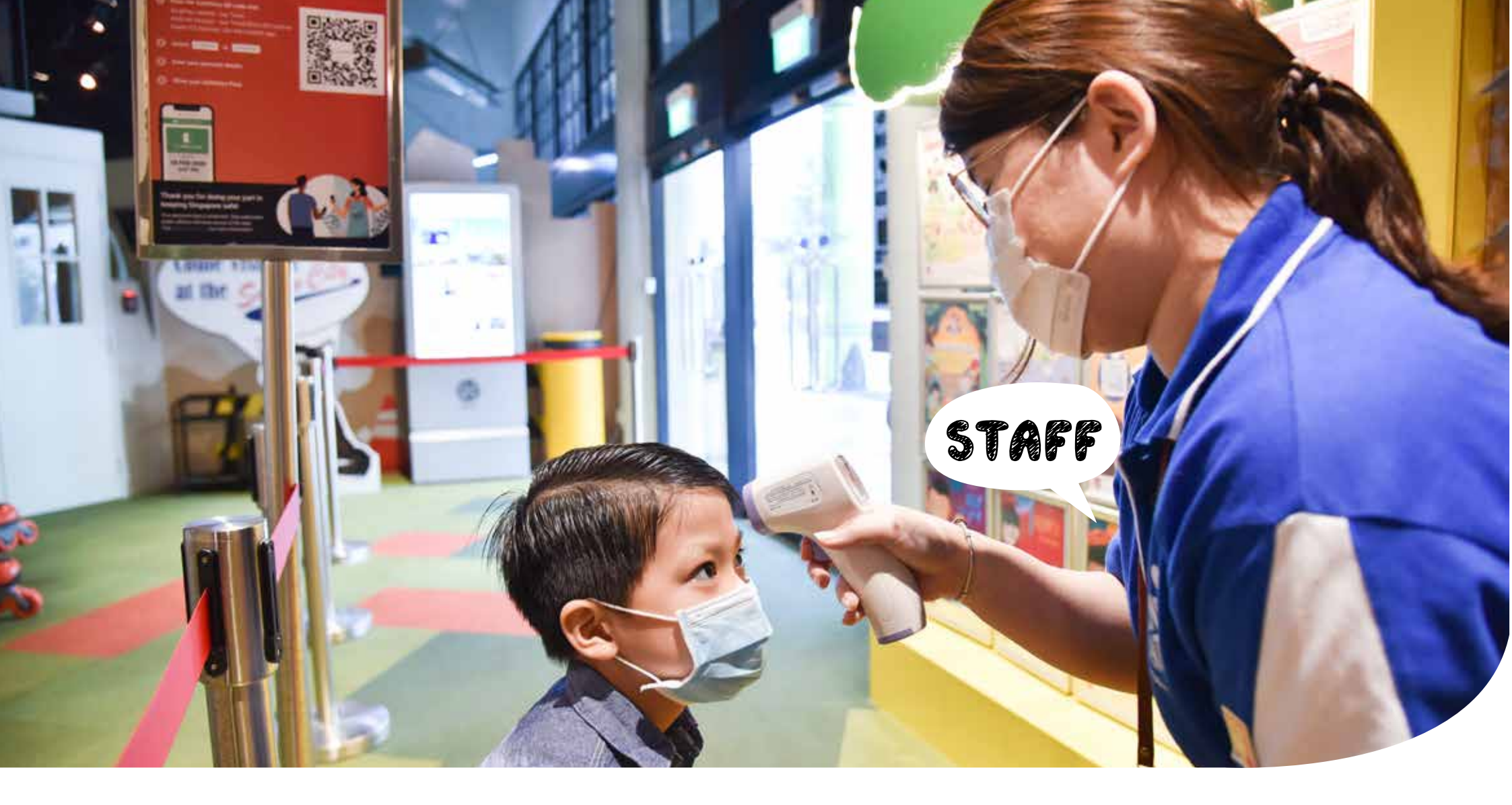
First, the staff at KidsSTOP™ will check my temperature and scan my TraceTogether token.