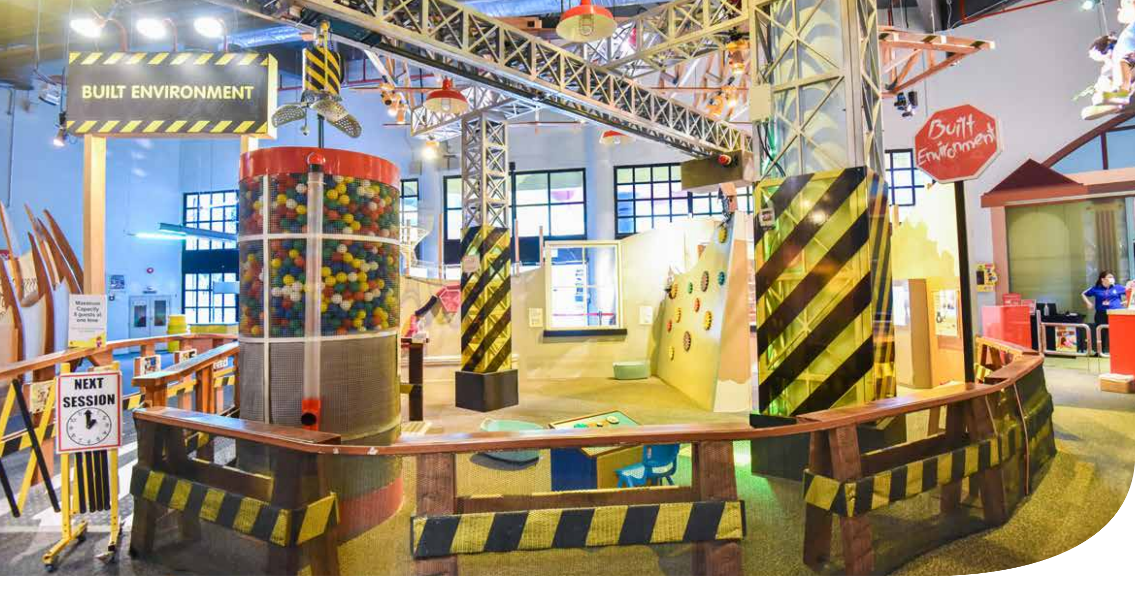
This is Built Environment .