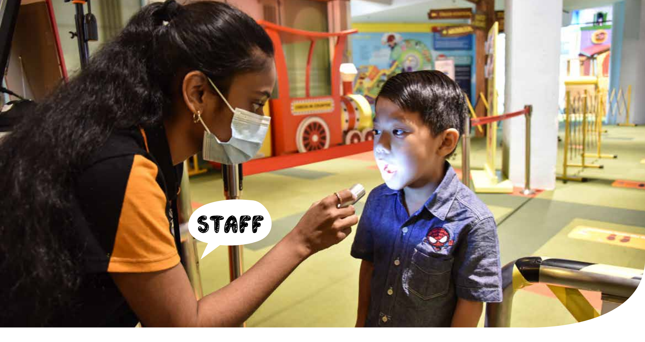
The staff at KidsSTOP™ will check my hands and mouth with a torch.