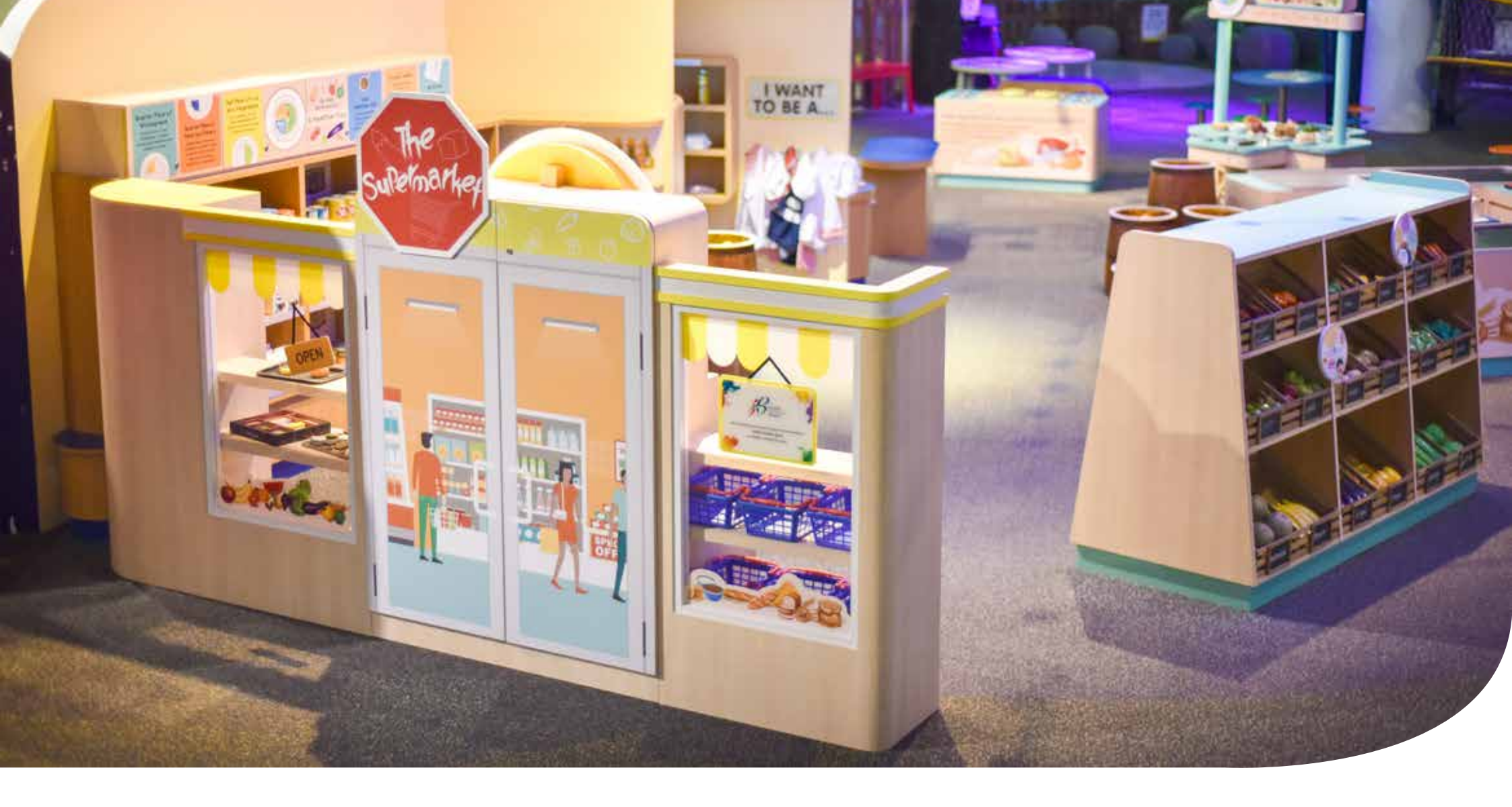
This is The Supermarket.