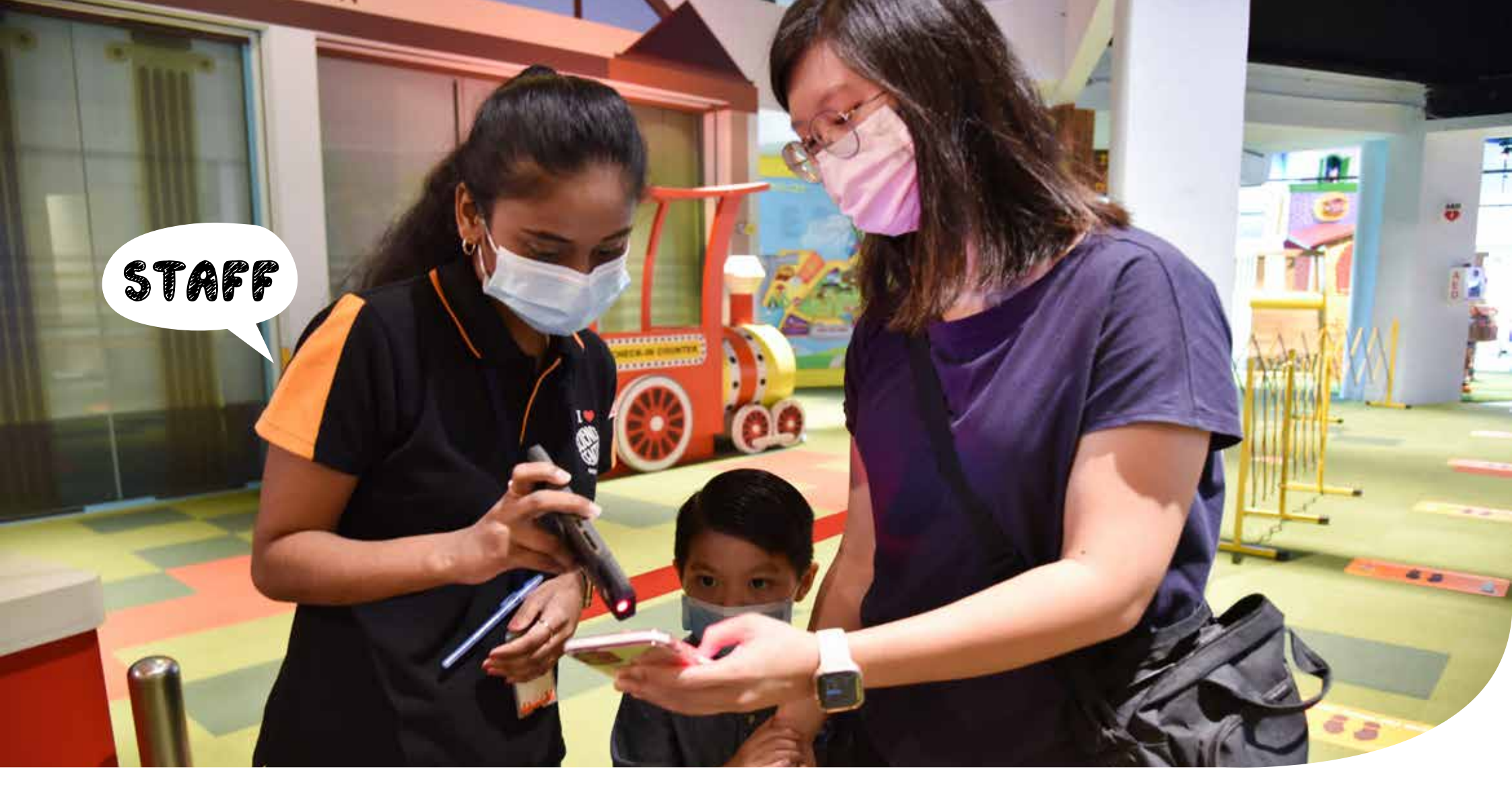
The staff will scan my tickets so that I can enter KidsSTOP™.