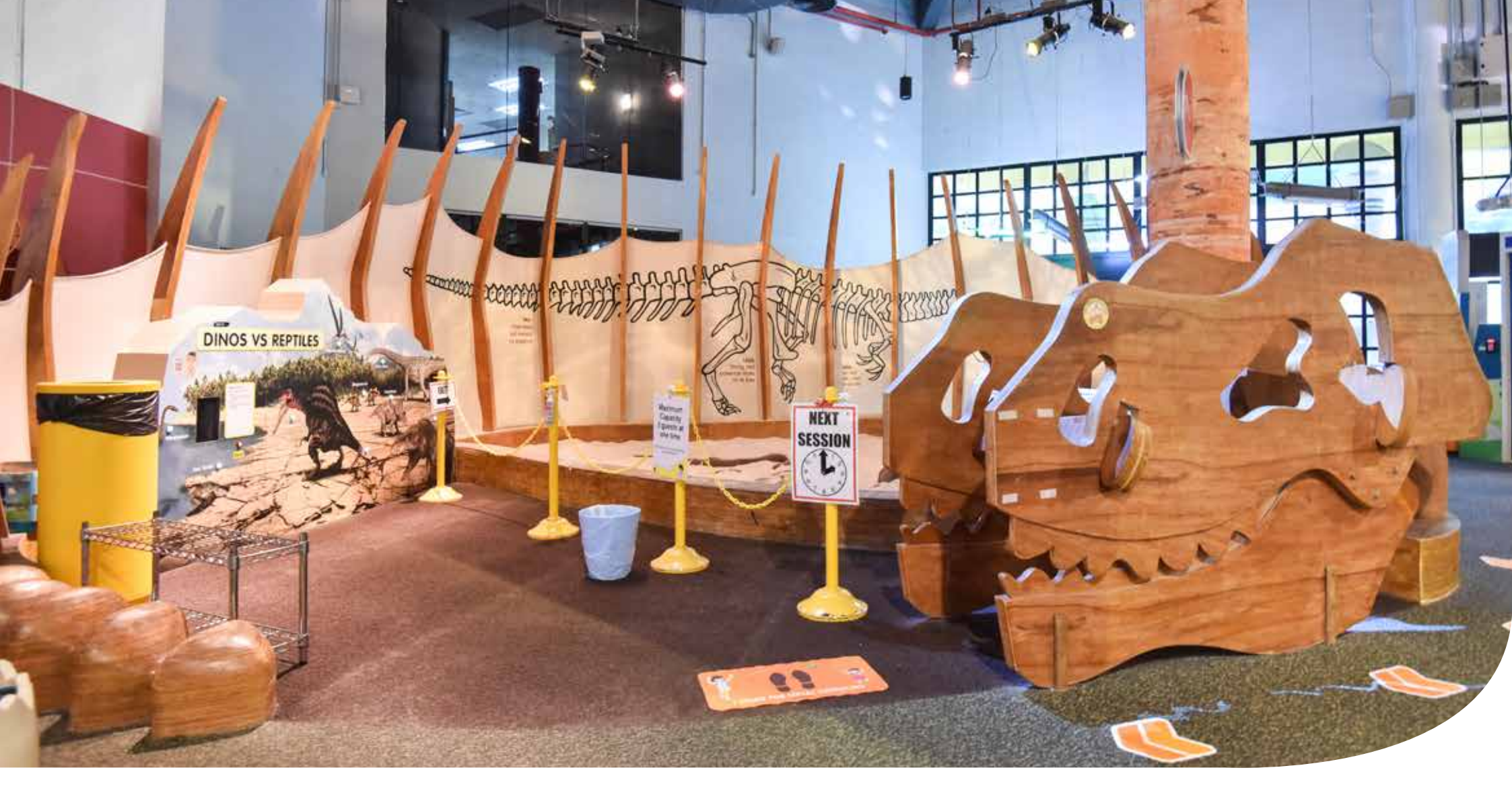
This is Dino Pit.