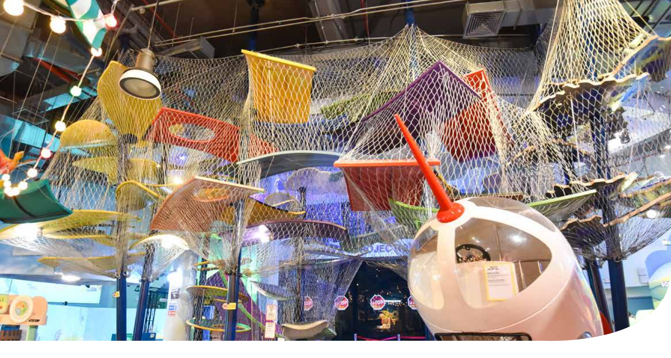
This is Dream Climber.